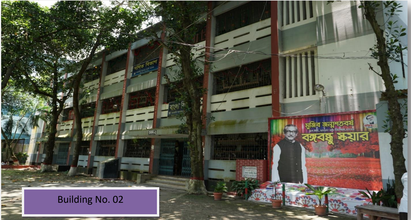
Building No. 02