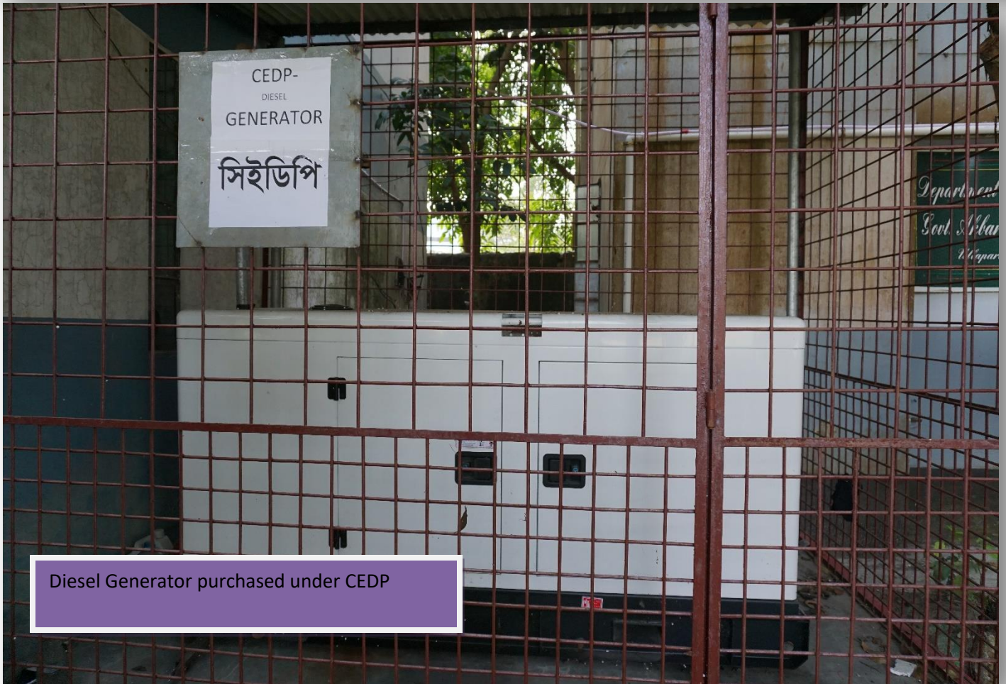
Diesel Generator purchased under CEDP