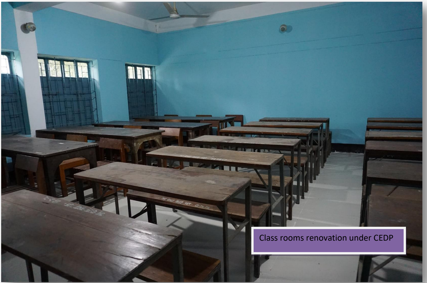
Class rooms renovation under CEDP