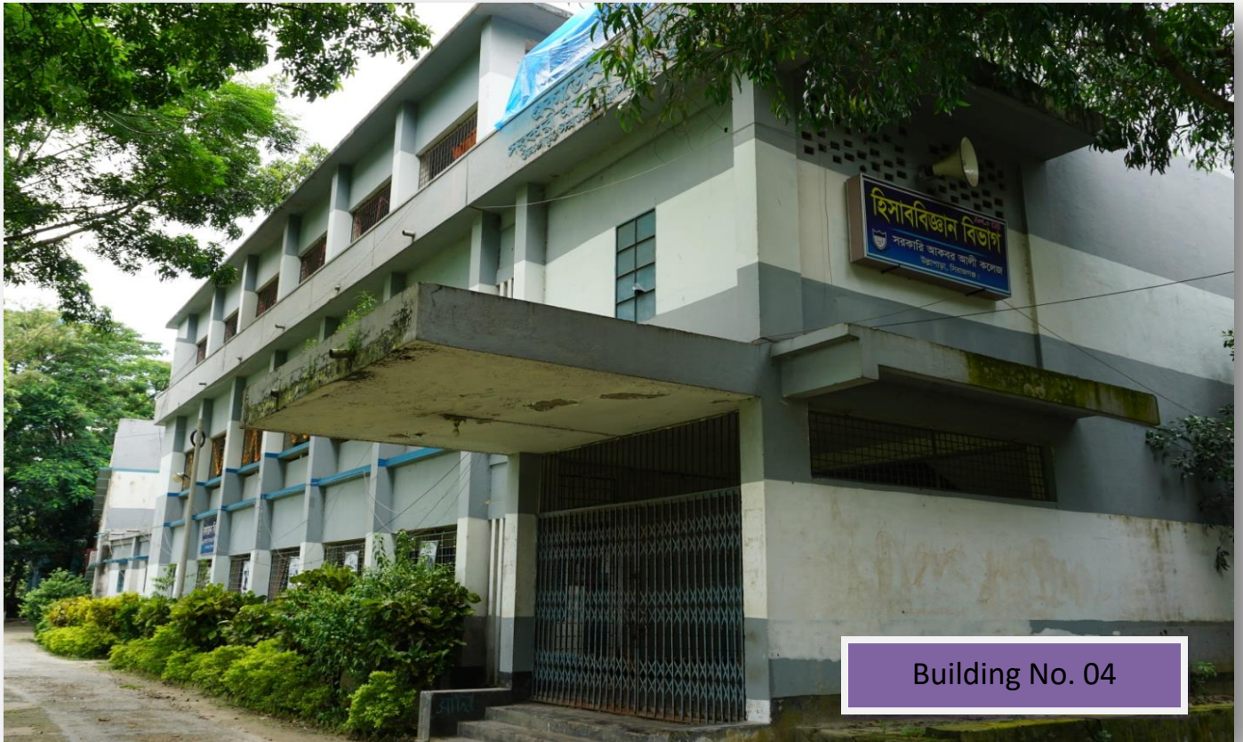
Building No. 04