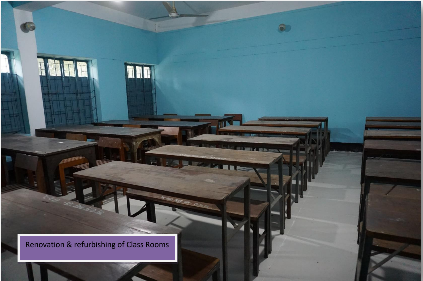
Renovation & refurbishing of Class Rooms