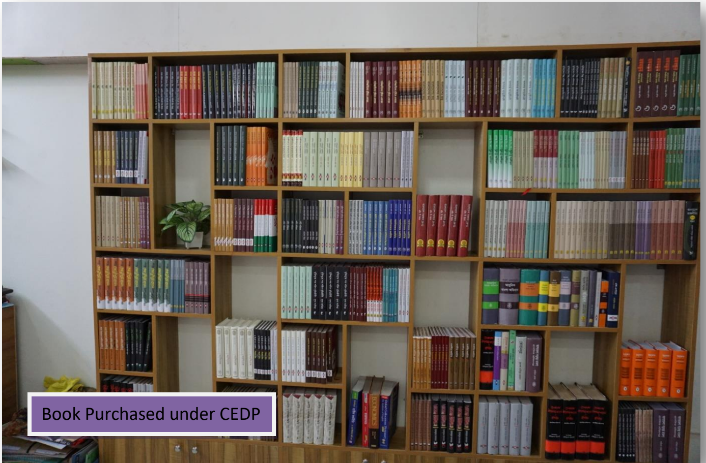
Book Purchased under CEDP