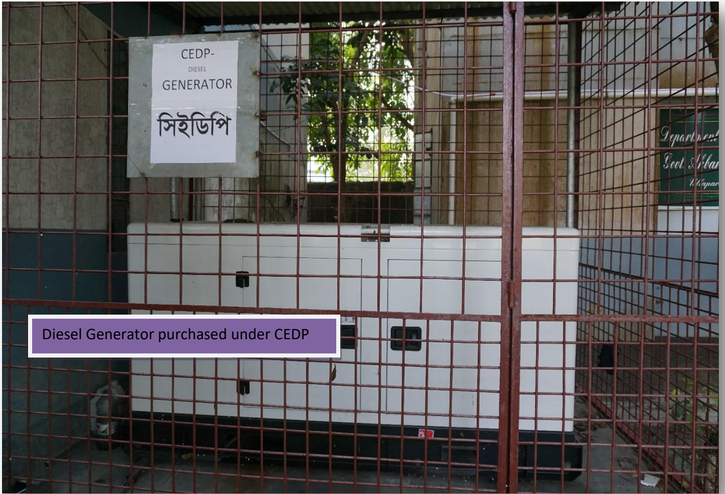
Diesel Generator purchased under CEDP