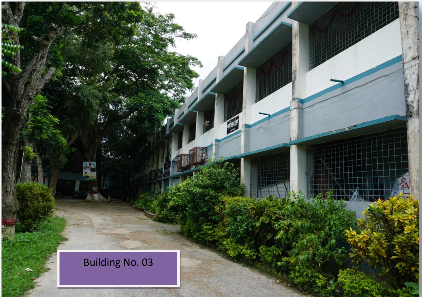
Building No. 03