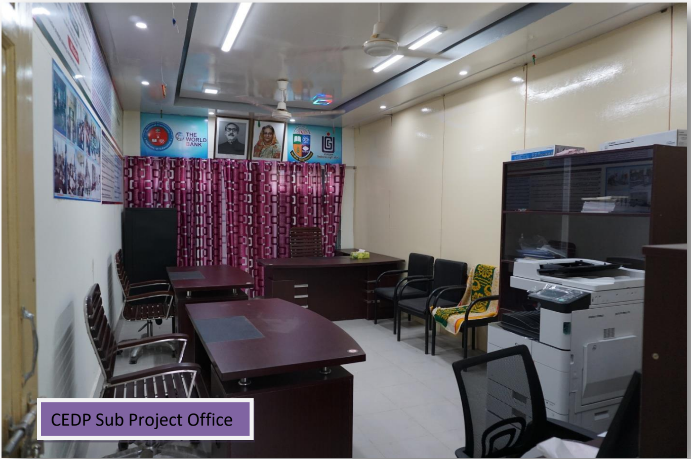
CEDP Sub Project Office