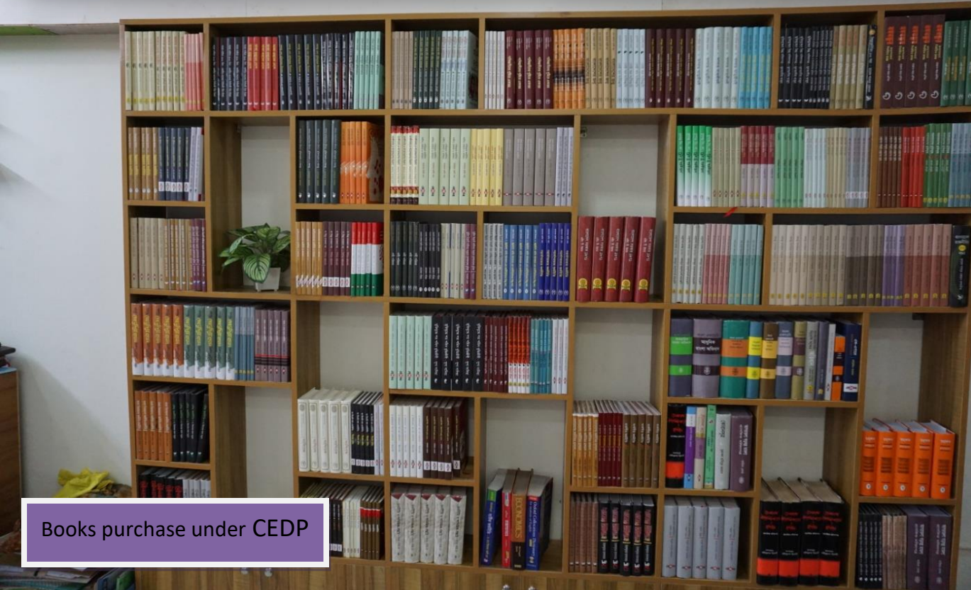
Books purchase under CEDP